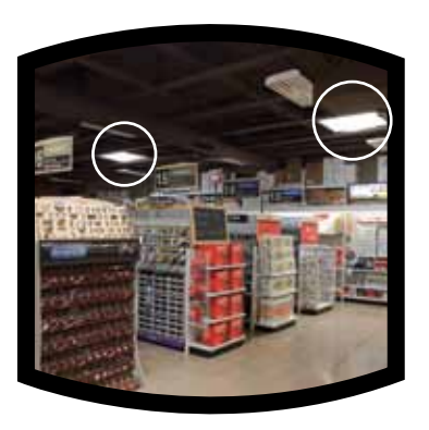
Retail store with SunWave SMRT lighting